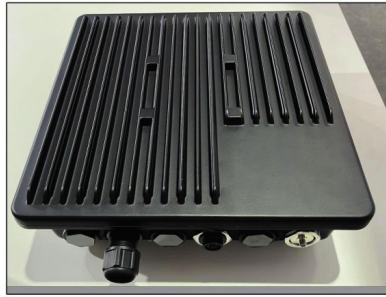
Fig 3 – Photo of the radio